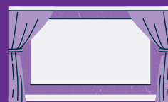
355 Seat Fully Accessible Theater