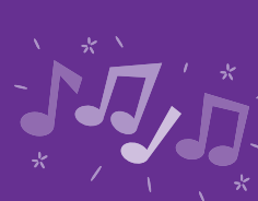
Film, Music, and Dance Studios