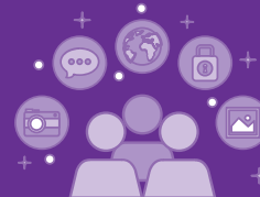
Community Gathering Space