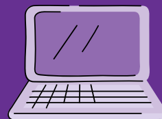
Technical Theatre Lab