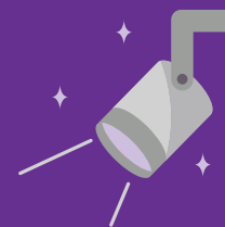
Flexible Blackbox Performance Space